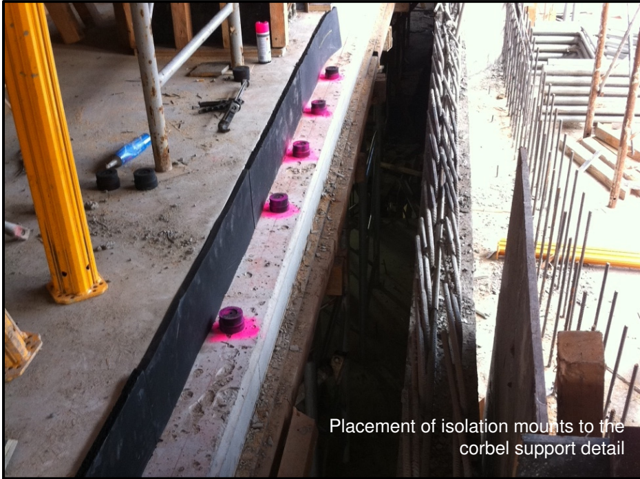
Placement of isolation mounts to the corbel support detail