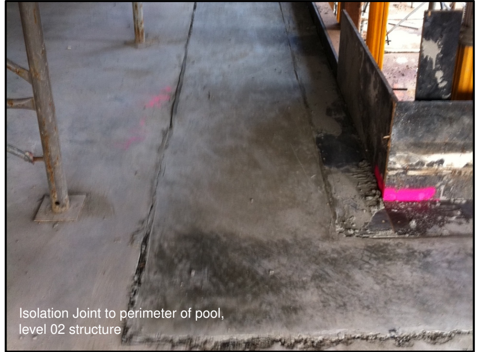
Isolation Joint to perimeter of pool, level 02 structure