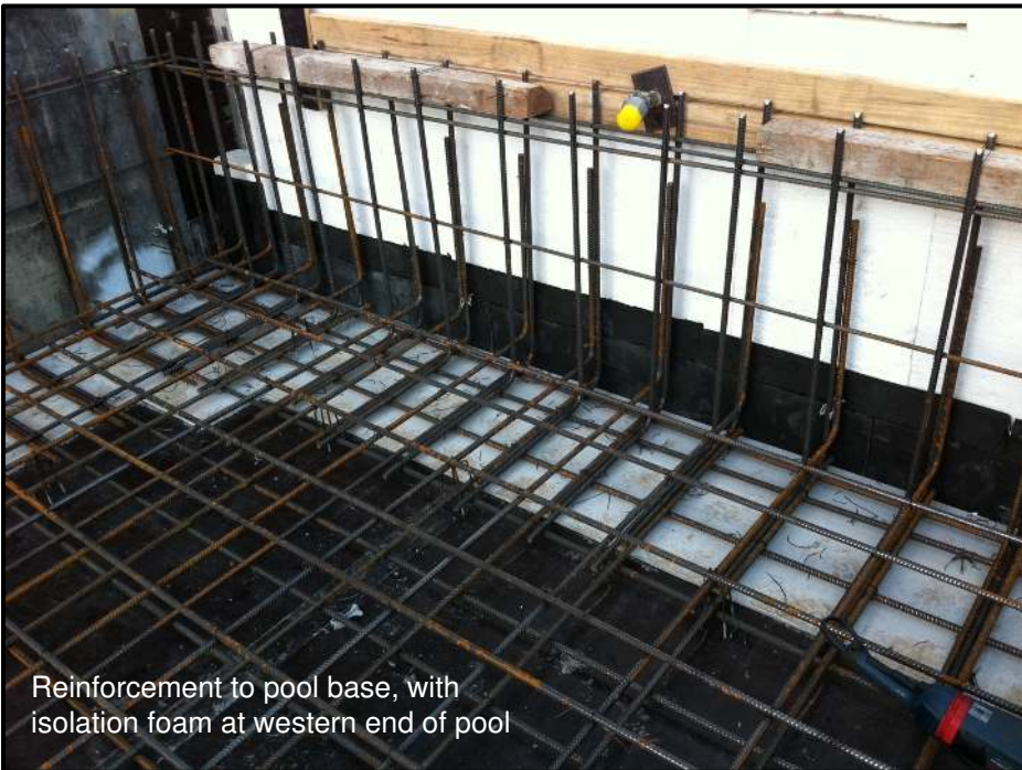
Reinforcement to pool base, with isolation foam at western end of pool