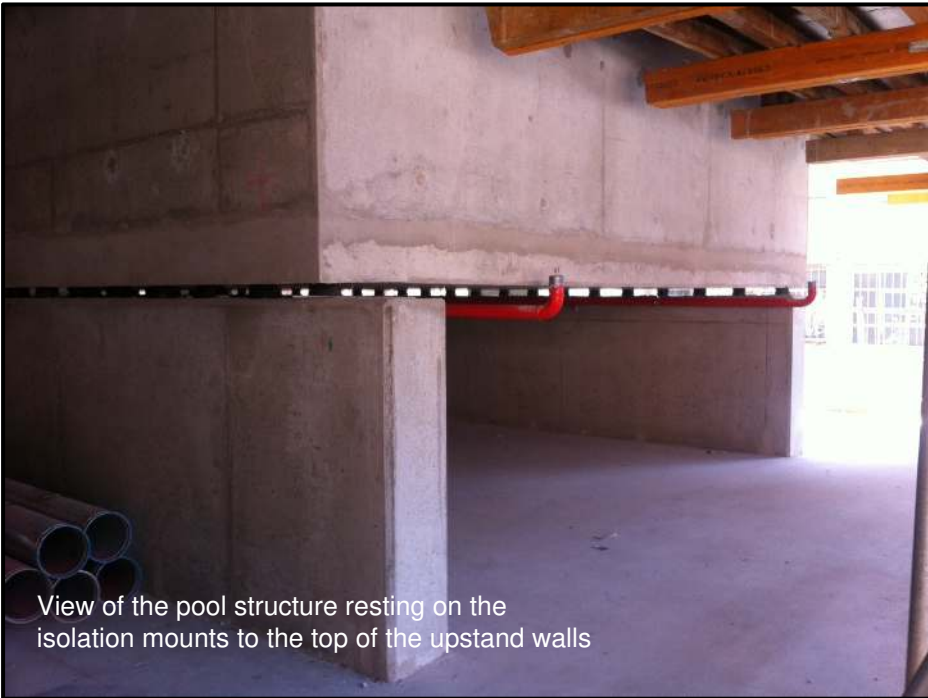
View of the pool structure resting on the isolation mounts to the top of the upstand walls