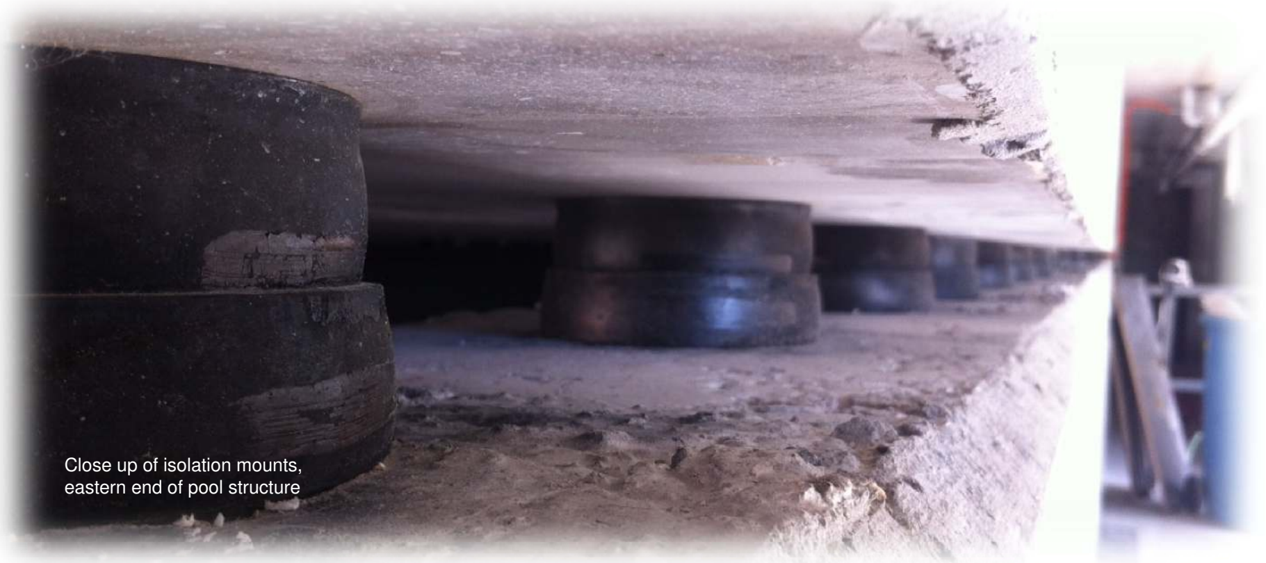
Close up of isolation mounts, eastern end of pool structure