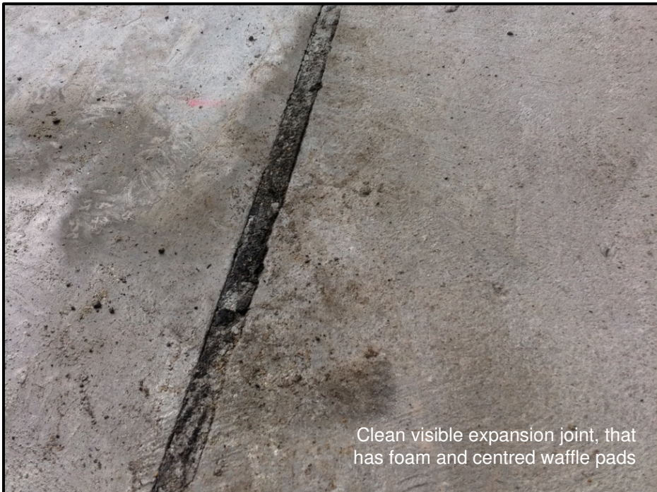
Clean visible expansion joint, that has foam and centred waffle pads