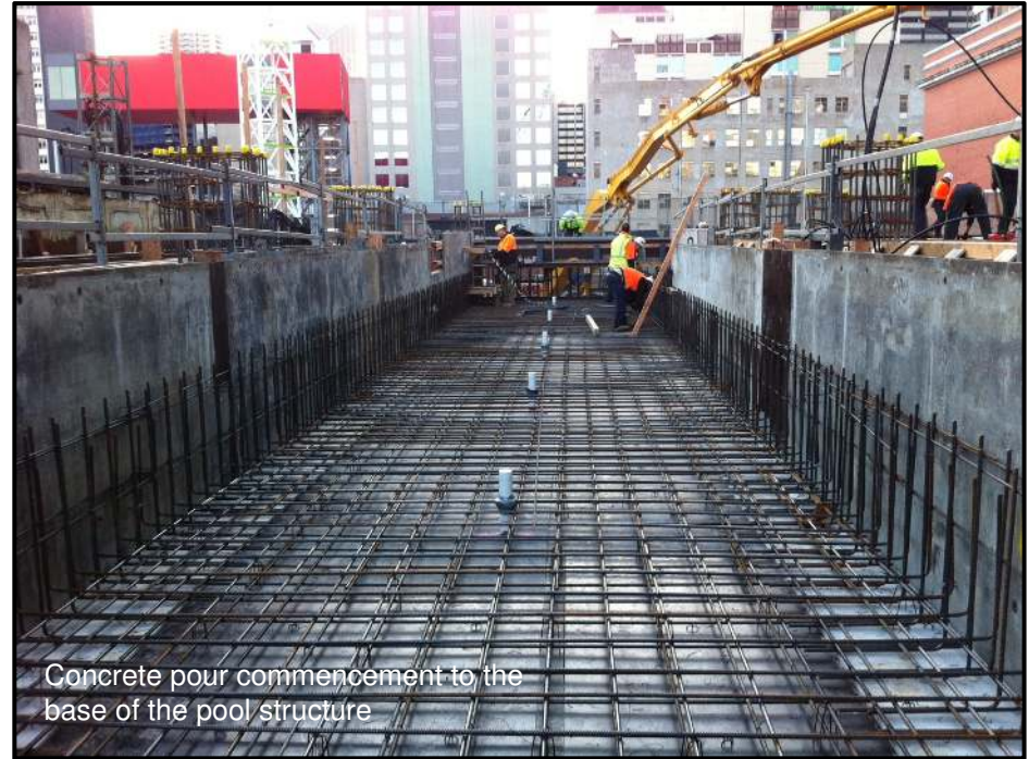
Concrete pour commencement to the base of the pool structure