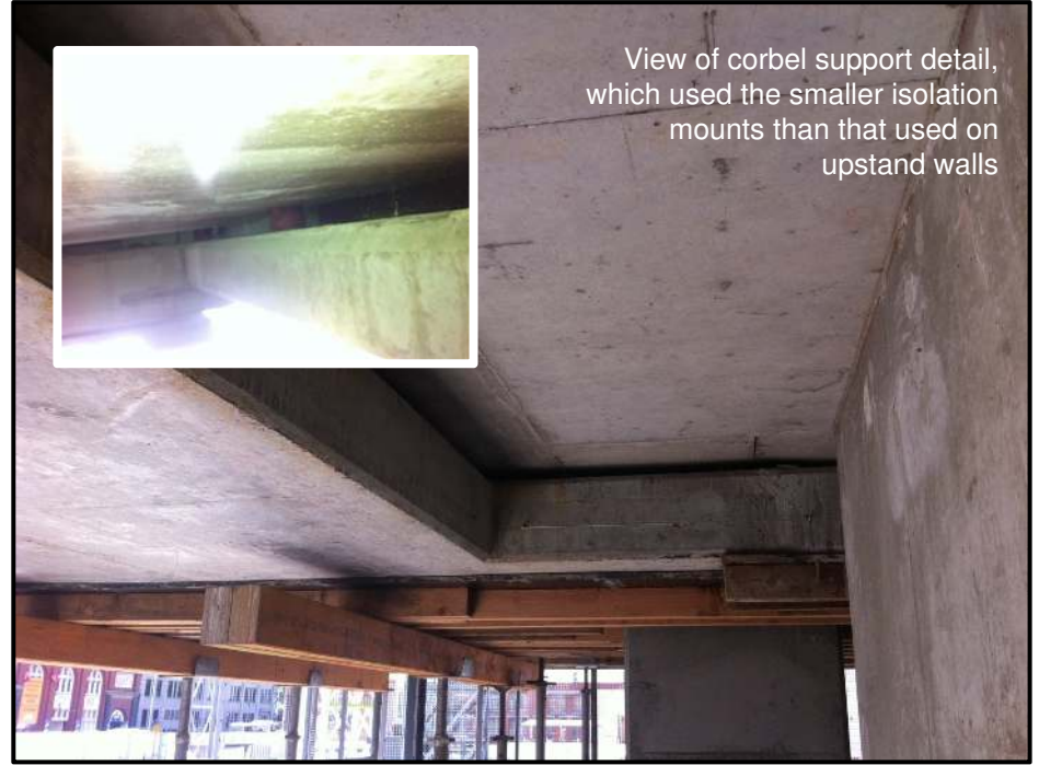
View of corbel support detail, which used the smaller isolation mounts than that used on upstand walls