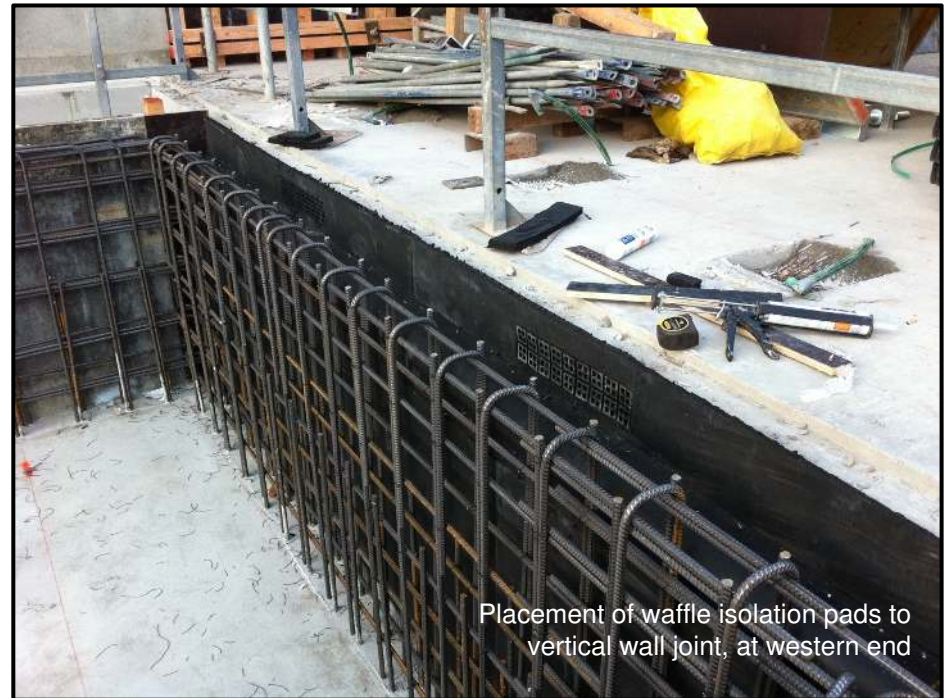
Placement of waffle isolation pads to vertical wall joint, at western end