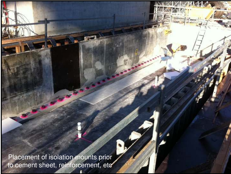
Placement of isolation mounts prior to cement sheet, reinforcement, etc