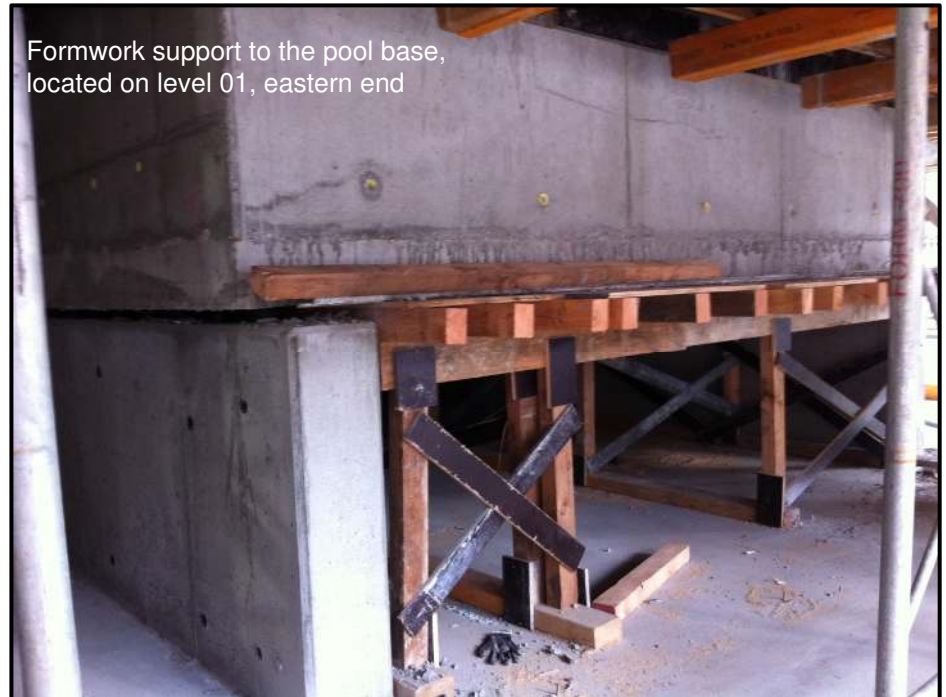
Formwork support to the pool base, located on level 01, eastern end